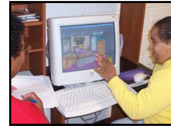
Day Habilitation uses state-of-the-art software in its computer classrooms.

Community Employment Services offers individuals the opportunity to work in the community while receiving support and supervision from staff. These services include customized job development, individualized job placement, and on-going long-term support. Prior to initiating job placement, CES staff gains knowledge about the individual's strengths, needs, abilities, and preferences. All individuals employed in community jobs are paid by their employer.