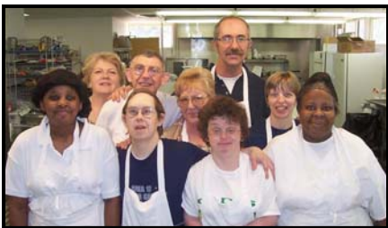
Quantum Catering prepares everything from daily meals to gourmet party platters.

CCDS and its subsidiary corporation, Quantum, Inc., have been active parts in the Savannah community for more than 35 years. In the past decade, CCDS has become a leading force in the state by providing quality services to people with disabilities.